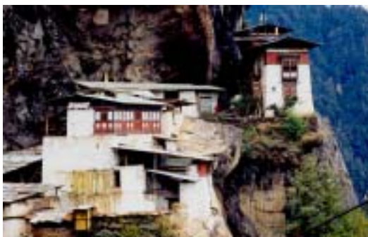
A typical Buddhist monastery in Bhutan